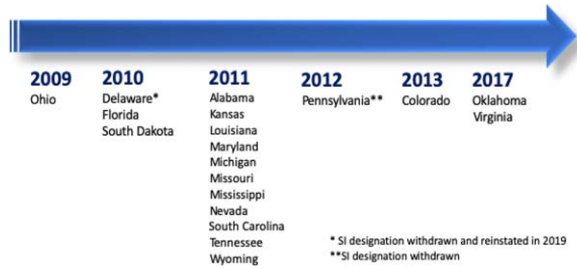
Figure 2. SORNA substantial implementation designations.

of requirements pertaining to public websites, international travel, and registration of adjudicated juveniles (OAG, 2011, 2016). Additionally, the SMART Office modified its processes for working with states to facilitate implementation, and adjusted its thresholds for evaluating adherence to SORNA criteria. Recognizing the unique aspects of each jurisdiction's legal and operational landscape, the DOJ and SMART Office shifted from a fairly literal standard (termed "substantial compliance") to a more flexible standard ("substantial implementation") (SMART Office, 2016b). Whereas the "substantial compliance" threshold required states to align directly and fully with SORNA guidelines, "substantial implementation" recognized state provisions that "did not substantially disserve" the purpose of each of SORNA's fourteen standard areas (see Table 1). Coupled with this more flexible process, the DOJ also established a mechanism for non-implemented states to recapture the 10-percent JAG "penalty" that would otherwise be held for non-compliance, provided that these funds be utilized for purposes consistent with SORNA's goals. These and other key shifts in DOJ policy contributed to additional states achieving substantial implementation status beginning in 2011, as noted in Figure 2.